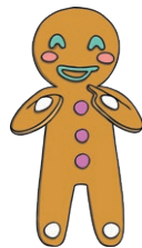
The Gingerbread Man