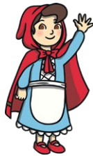
Little Red Riding Hood